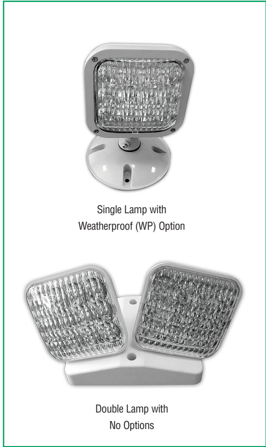
Single Lamp with Weatherproof (WP) Option

U.L. listed and meets or exceeds the following: U.L. 924, N.E.C. requirements and N.F.P.A. 101.