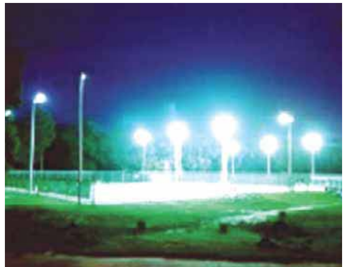
Floodlighting produces uncontrolled light.

Traditional floodlighting is characterized by high levels of brightness (glare), uncontrolled illumination outside the boundaries of the facility (spill light), and a noticeable luminous haze above the playing area (sky glow). Visors, louvers and shields are often used to try to minimize the negative effects of floodlighting. These devices reduce fixture efficiency and have only limited ability to reduce glare, spillage and sky glow.