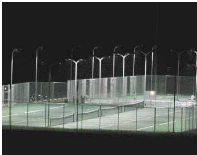
Full cutoff lighting produces more useable illumination.

Full Cutoff Sports Lighting increases the level of useable light on the playing area while addressing light impact concerns such as glare reduction, light spillage and sky glow. Full cutoff lighting systems utilize a recessed lamp in a fixture housing that is parallel with the playing surface. This design increases playing area illumination, reduces glare and light spillage in surrounding areas and eliminates upward light and sky glow.